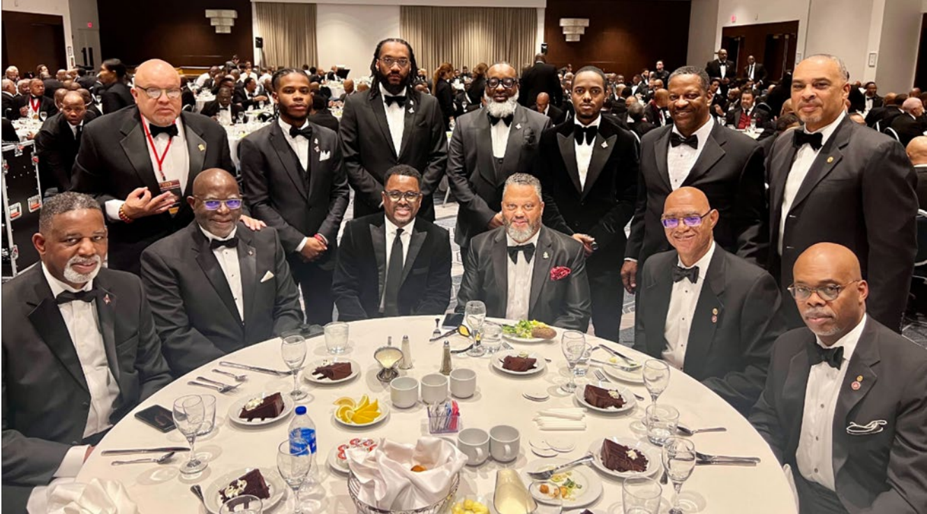
Photo 15: CPSS brothers at EPC closed banquet (461 brothers attended overall)

On March 23-26, 2023, CPSS and Theta Theta brothers attended the 2023 Eastern Province Council (EPC) at the Sheraton Norfolk Waterside Hotel, Norfolk, VA. 13 CPSS brothers attended including 2 Spring 2023 neophytes.