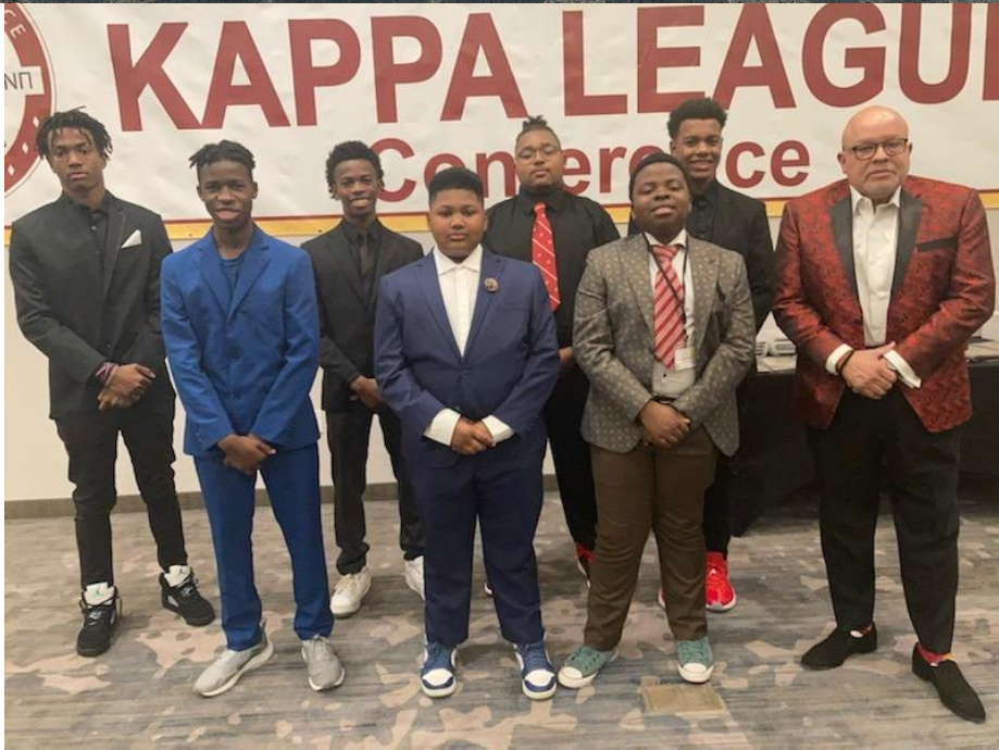
Photos 26-27: At EP Kappa League Conference at Virginia State University