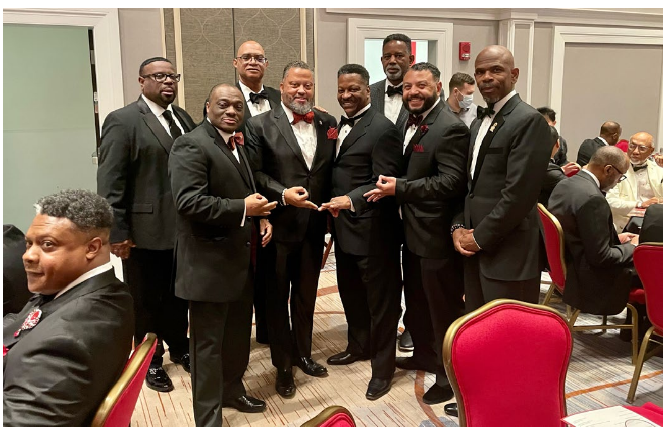
Photos 36-37: At the Eastern Province KAW 112th Founders' Day J5 Celebration