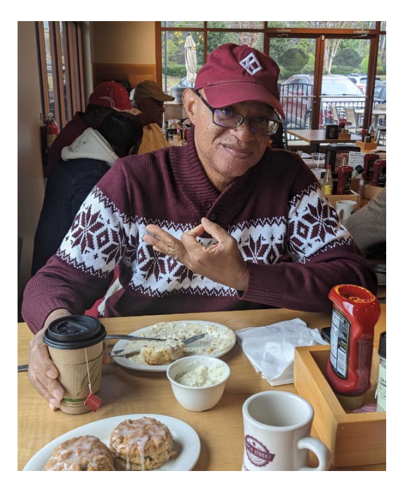
Photos 43-44: At the Eastern Province KAY 112th Founders' Day J5 Celebration (The morning after, LOL)

Benefits of CPSS Membership: The Reclamation & Retreat Committee developed the below to outline benefits of membership with CPSS. This slide is posted on slack in the #reclamation channel. Please feel free to share: