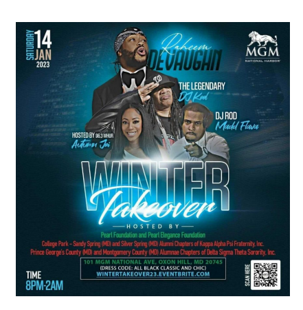
Jan 14 Winter Takeover