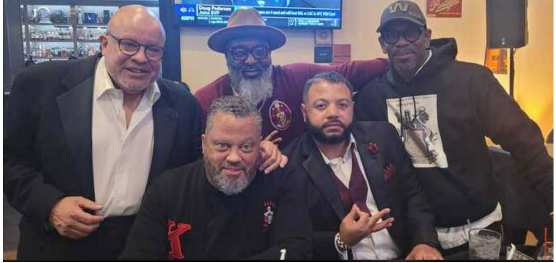
Photos 38-42: At the Eastern Province KAY 112th Founders' Day J5 Celebration (After Party)