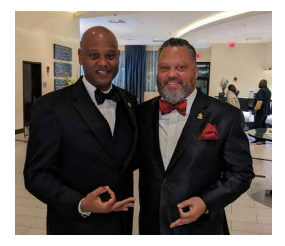
On January 7, CPSS brothers gathered in Richmond Virginia for the Eastern Province J5 Celebration of the KAW 112th Founders' Day!