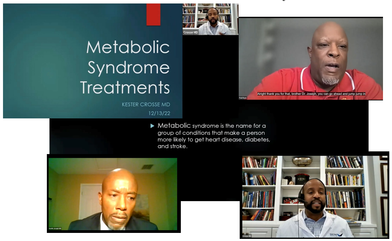
Photos 1-5: Health and Wellness Seminar on Metabolic Syndrome Screenshots

On December 13, 2022, CPSS brothers and guests gathered virtually for a CPSS Health and Wellness Seminar on Metabolic Syndrome . The content and discussion were lifesaving. Significant positive feedback was provided by attendees. Useful info, links, and a video of the presentation are posted in the #health-wellness channel on Slack. The next seminar is scheduled for January 21.