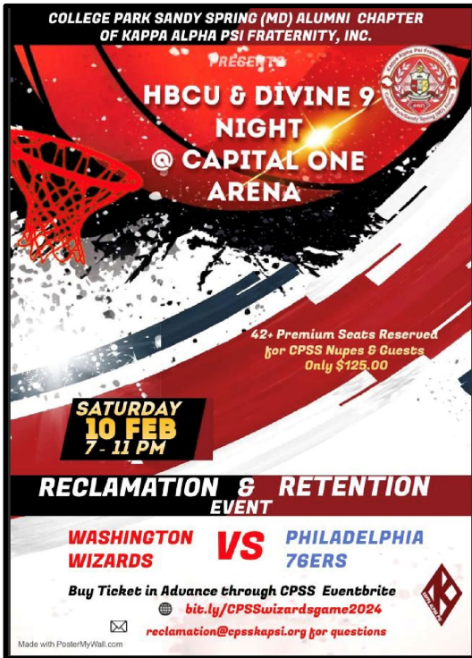
Wizards Game Link